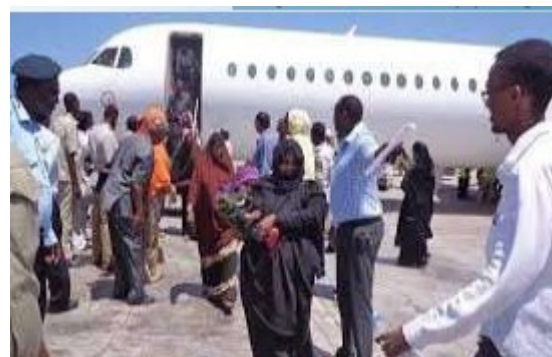
Refugees return to their country of origin. Les réfugiés retournent dans leur pays d'origine.