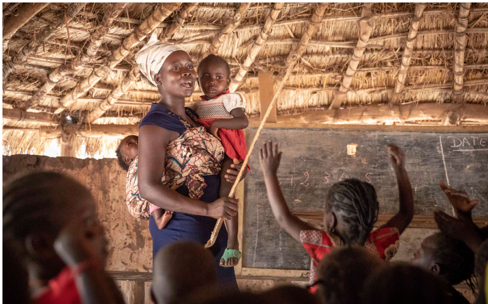
Preschool in the Makpandu refugee settlement in South Sudan, launched and run by the Youth Association for Peace and Development (YAPD), a refugee-run community group.