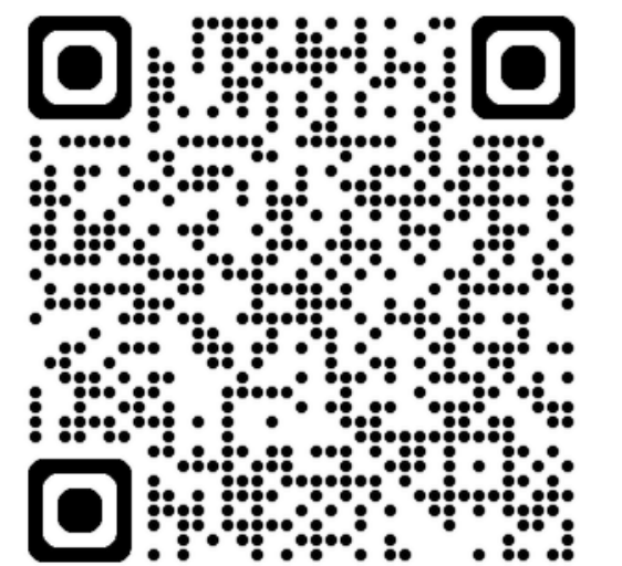
UNHCR Bulgaria's WhatsApp Channel