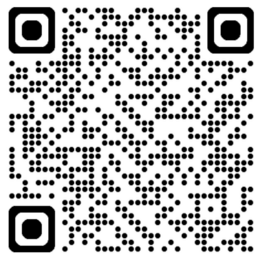
UNHCR Bulgaria's Telegram Channel

From November to December 2024 , eligible families will receive a notification through SMS to your mobile phone number. This SMS will confirm how you can collect the cash through Western Union.